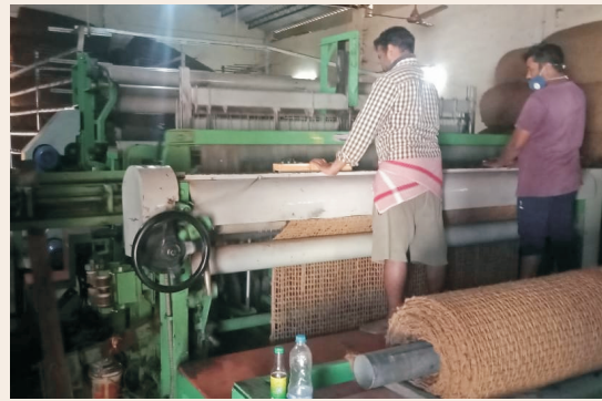
Coir Geo Textile