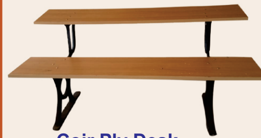
Coir Ply Desk