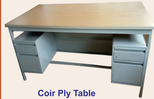
Coir Ply Table