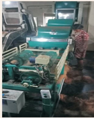
2 Ply Coir Yarn