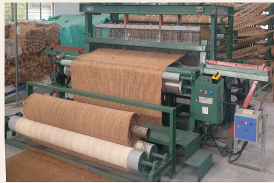
Natural Coir Matting