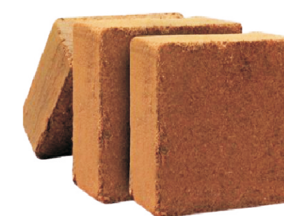
Coir Pith Block