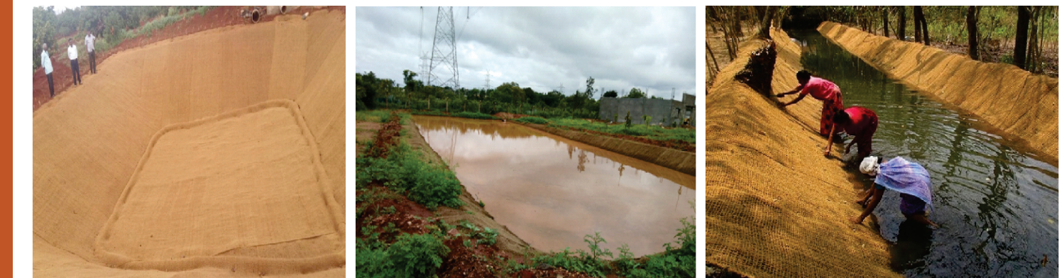
Krushi Honda by Using Coir Geo-Textiles