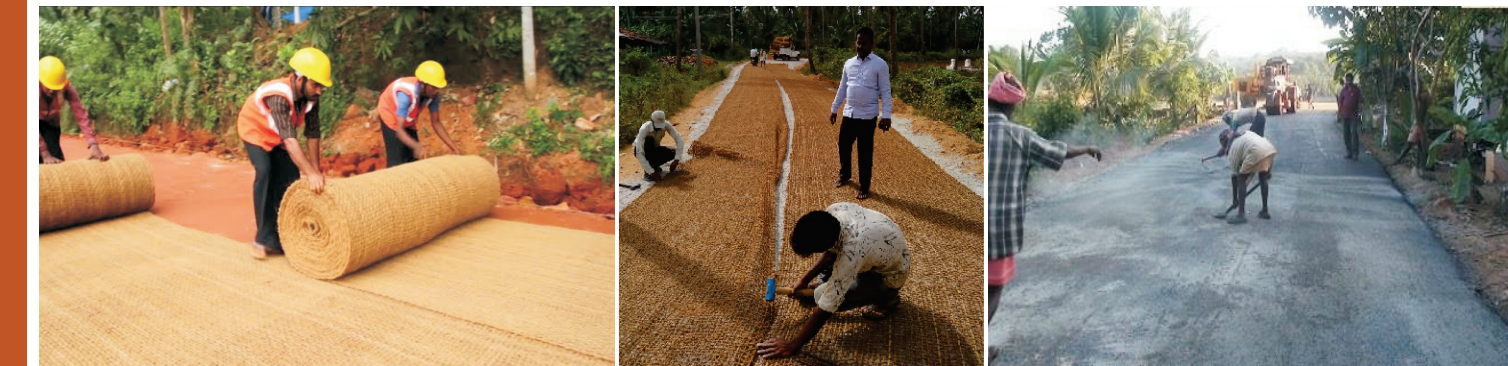
Rural Road Construction by Using Coir Geo-Textiles