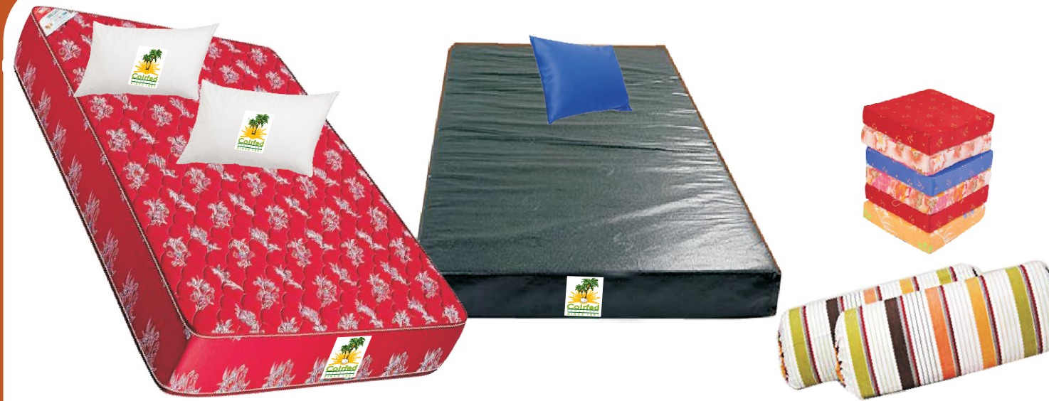
Rubberised Coir Mattress