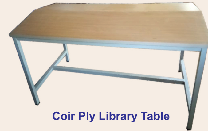
Coir Ply Library Table