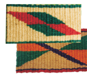
Corridor Coir Mats