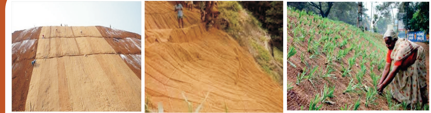
Soil Erosion Control by using Coir Geo-Textiles