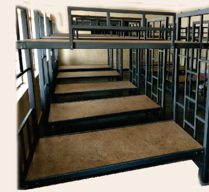
Coir Ply Two Tier Cot