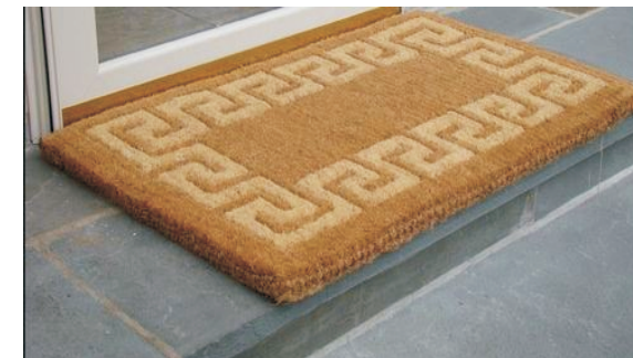
Inlaid Coir Mat