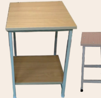
Coir Ply Stool