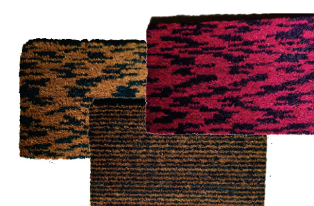
VC8 Carnatic Coir Mat