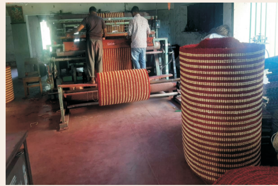
SK1 Coir Matting