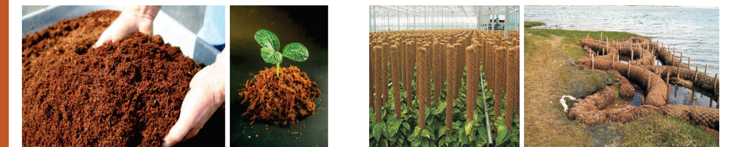
Coir Pith Bio Fertilizer