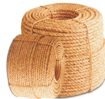
Twisted Coir Fibre